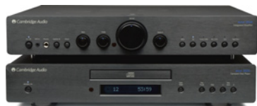
Perfect partners, the 350A and 350C...

The 350A offers a plethora of inputs and outputs to accommodate sources of all types. iPods and MP3 players get the VIP treatment and can be connected directly to the front panel via a dedicated 3.5mm jack. In addition, the supplied Navigator remote features iPod command codes enabling control of any iPod (except Shuffle) when connected to a suitable dock such as Cambridge Audio's new iD50.